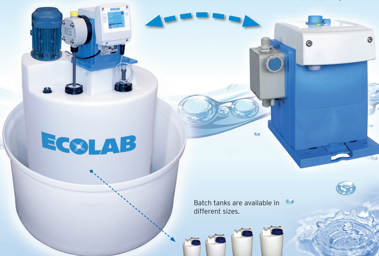
EcoPro from 5 to 120 l/h

Batch tanks are available in different sizes.