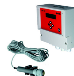
gas alarm device