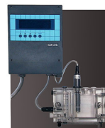
measuring unit for monitoring the chlorine dioxide content