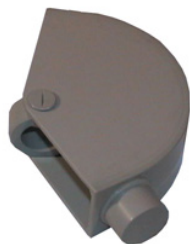
(shorten immersion depth)

* optional elongation (accessories on request)